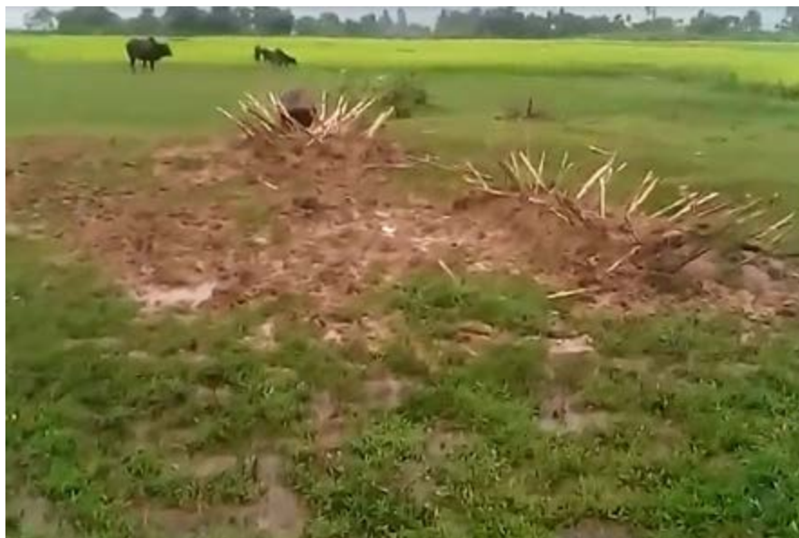
Screen shot of a video showing the graves of Rohingya victims of the August 2017 massacre in Chut Pyin. One witness said he saw 10-20 bodies hastily buried two to three per grave in these fields of a neighboring village.

International law defines deportation or forcible transfer as the “threat of force or coercion, such as that caused by fear of violence, duress, detention, psychological oppression or abuse of power against such person or persons or another person.” 6 PHR’s survey shows that the majority of hamlets within which meetings were convened during this time (81 percent) perceived the meetings as threats, and over half of the respondents from the affected areas reported that this was one of the reasons why they fled. This demonstrates the coercive nature of a widespread and systematic policy that seemed designed to ensure Rohingya communities left Myanmar.